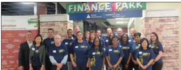
Prudential generously supported JA Finance Park by making a financial contribution coupled with employee engagement, sharing their time and talents with the Newark students who participated that day.

At the Capital One/JA Finance Park simulated city, 735 volunteers shared their world of work, while guiding students through a day-long budgeting simulation as they lived the life of an adult. Students are tasked with developing and managing fictional household budgets, applying for home and auto loans, and paying their bills. The goal – stay out of debt!