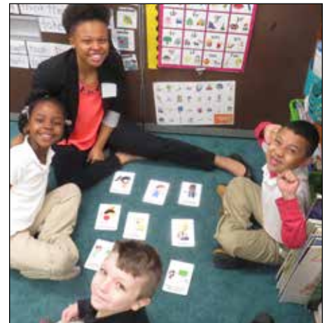
JA High School Heroes enhance important skills today's employers seek in their workforce, all while inspiring and preparing their younger peers to dream big.

"The most important lesson I learned is hope. Kids have so many wonderful ideas, and JA encourages students to follow their entrepreneurial dreams."