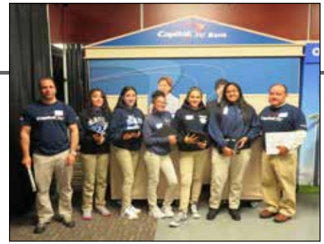
Whether bowling for JA, volunteering in elementary school classrooms, or supporting JA Finance Park students, Capital One Bank is committed to empowering our young people.

JA empowers young people to own their economic success. Our volunteer-delivered K-12 programs foster work-readiness, entrepreneurship, and financial literacy skills, and use experiential learning to inspire kids to dream big and reach their full potential. These programs are provided to NJ schools at no cost, complement the classroom curricula, and are easily integrated into the lesson plans for each grade level.