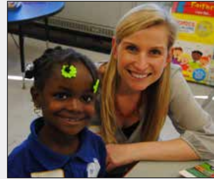
As an annual supporter of JA Finance Park and a JA Day, Citi volunteers serve as role models to students helping them gain money management skills, inspiring them to be business owners, and empowering them with skills needed to be successful in the workforce.