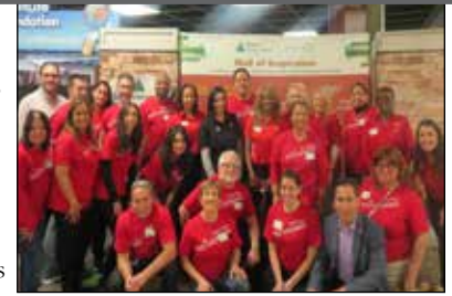
Wells Fargo is committed to helping young people gain the skills they need to succeed by supporting the JA Capstone programs, a JA Day, and by sponsoring the Hall of Fame, JANJ's signature fundraising event.