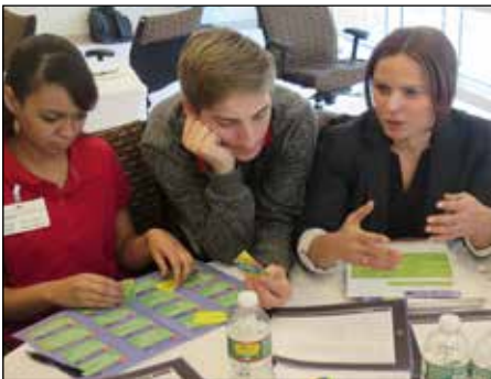
With the coaching of a Wiley-CrossKnowledge volunteer, students from Hoboken High School explored workplace conflict resolution strategies.

JANJ would like to recognize our corporate hosts AIG, ARI, ETS, Peapack-Gladstone Bank, Prudential, PwC, Samsung, and Wiley-CrossKnowledge, as well as our college hosts DeVry University, Drew University, Fairleigh Dickinson University, Felician University, Rutgers University, Stevens Institute of Technology, Stockton University, and St. Peter's University.