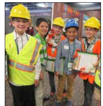
Utility and Pipeline Engineers lay pipes, check utility meters, invoice businesses for usage, and talk with citizens about conserving energy in JA BizTown.