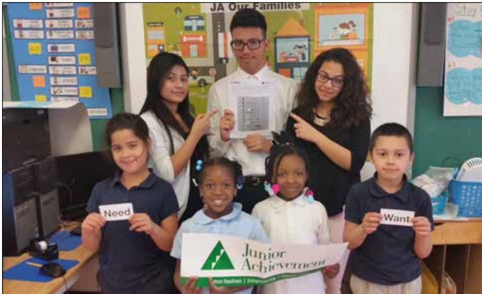
Students from Brimm Medical Arts High School served as PSEG High School Heroes Energy Ambassadors as they taught JA's curriculum to elementary youth at U.S. Wiggins College Preparatory Lab School in Camden. Through PSEG's long-standing partnership, high school students learn about careers in energy, strengthen their leadership skills, and share conservation tips with younger children.

The highly-demanded JA High School Heroes initiative provides meaningful leadership and service-learning opportunities for high school students outside their classrooms. In 2015-2016, 2,720 Heroes honed their leadership, presentation, and communication skills as they taught JA programs in 1,385 elementary classrooms leaving a lasting impression on 27,531 students in their local communities.