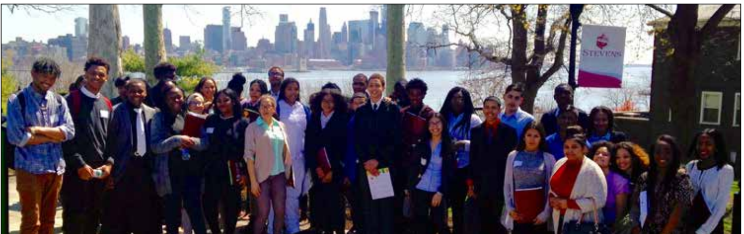
As part of a growing initiative, JANJ hosted several JA Career Success Workshops on college and university campuses throughout the state, including Stevens Institute of Technology. After completing lessons focused on the 4Cs of communication, collaboration, critical thinking, and creativity, the high school sophomores and juniors met with college representatives and took a tour of the campus.

– Workshop Student, Parsippany High School