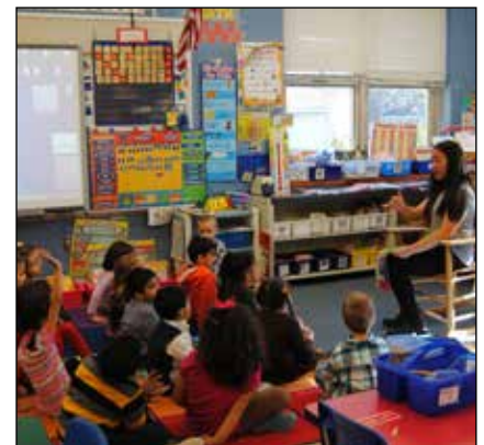
Pictured above is just one of 2,720 Heroes who taught JA's curriculum to 27,531 elementary school students statewide.