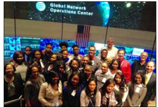
Students from Irvington High School had the opportunity to tour AT&T's Global Network Operations Center as part of an AT&T Aspire Job Shadow.

We would like to thank our 2015-2016 Job Shadow hosts: Accenture, AT&T, BARD, EY, Goya, Horizon Blue Cross Blue Shield of New Jersey, Johnson & Johnson Ethicon, Marriott, Munich Re, Nokia (formerly Alcatel-Lucent), Samsung, and Synchronoss Technologies.