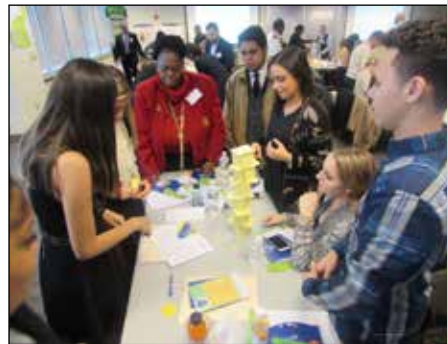
Imagine using only paper clips and index cards to build the tallest tower possible with a group you just met. These students did just that to build their communication and leadership skills.

"I learned to be respectful and effective in the workplace. I also learned how to take responsibility and work together as a team. It is through challenges and failures that a person becomes a better form of him/herself."