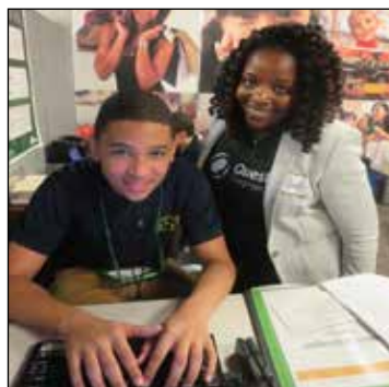
Strategic branding partner Quest Diagnostics opened the eyes and minds of JA BizTown students to their world of work while inspiring students to explore STEM careers.

– JA BizTown Student Woodland School, Warren