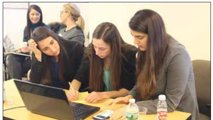
A team collaborated to make one of 12 critical decisions required to run their company during the JA Titan Finals held at Johnson & Johnson Ethicon.