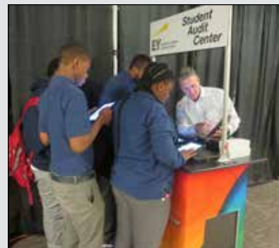
According to one student who checked out of the EY Audit Center with a balanced budget, "Today I learned that it is really hard to be a money making, money spending adult. Everyone in life has different situations, family and financial. Sometimes it is hard to stay in your budget. There are always unexpected twists and turns in your life and you have to deal with them."