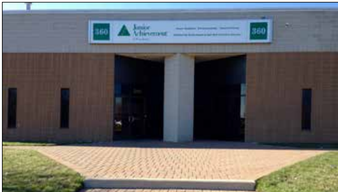
JANJ made history opening its first state-of-the-art Education Center.

JA BizTown and JA Finance Park underwent a strategic transformation in December 2015 when they relocated to Raritan Center Business Park, Edison. The new JA Education Center is a beautiful, secure learning environment for the thousands of students and volunteers who come through its doors annually. With its accessibility, it also serves as JANJ's state headquarters, and a venue for workshops, trainings, and special events.