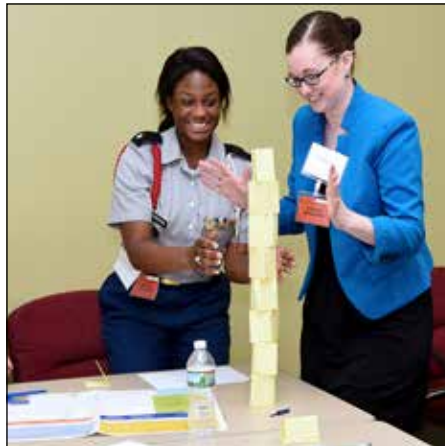
(Above) Following the panel discussion and one-on-one mentoring where students wrote their first-ever elevator pitches and bios, students and mentors participated in a small group activity designed to build communication, collaboration, and leadership skills. (Right) ADP generously supported the Central Forum and engaged female associates to serve as mentors.